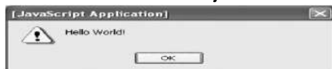
Fig 2.2 Alert box generated by a JavaScript statement.